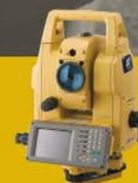
GPT-7000i Series Windows CE® Reflectorless Imaging Total Stations