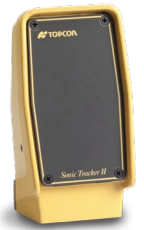
Sonic Tracker II

If you are looking to increase the speed at which you can grade, tighten your tolerances to save on materials and reduce the fuel burned and wear and tear on your motorgrader, 3D-MC 2 is exactly what you need!